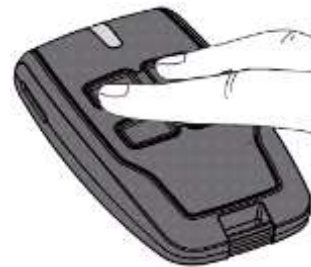
Mitto B RCB2/4