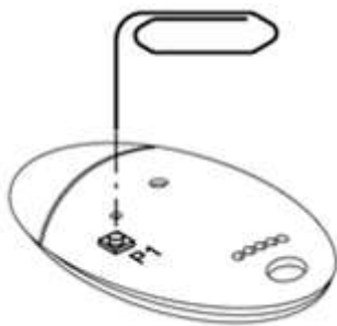
Older type Mitto

*Newer products do not have a hidden button - this function is now achieved by pressing the top 2 buttons together